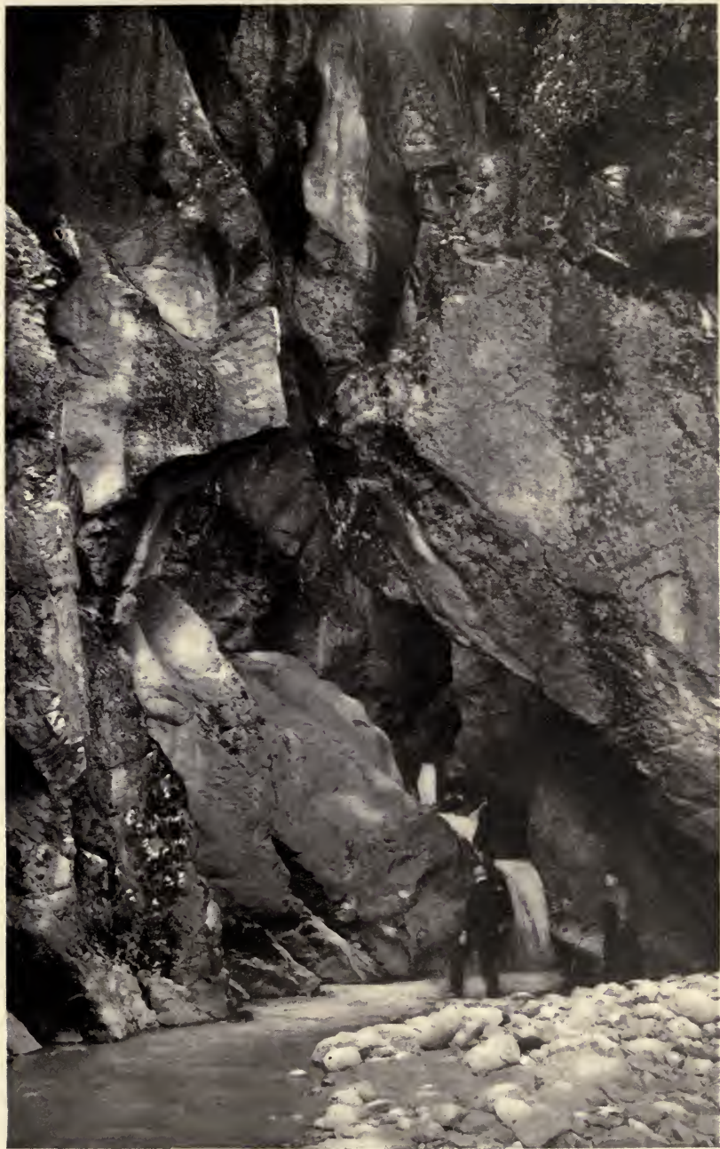
BOX CANON NEAR OURAY